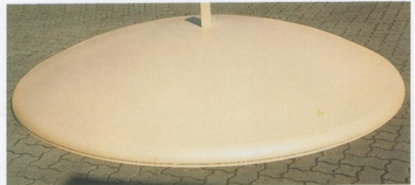
Normal dished end on head