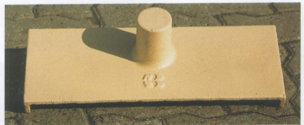
Acceptance brace side