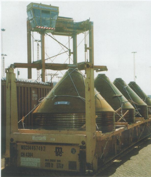
Silo cone Packed as export kit Ready for shipment