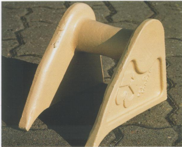
Acceptance brace centre